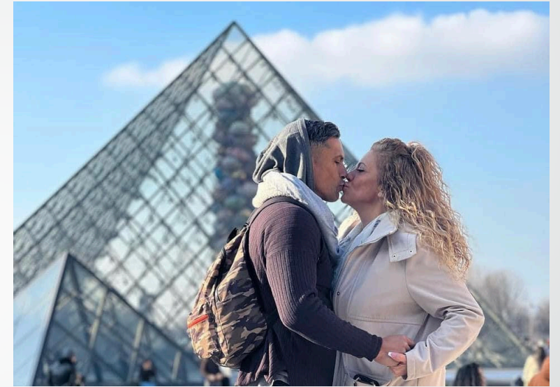
Traveling with my soulmate