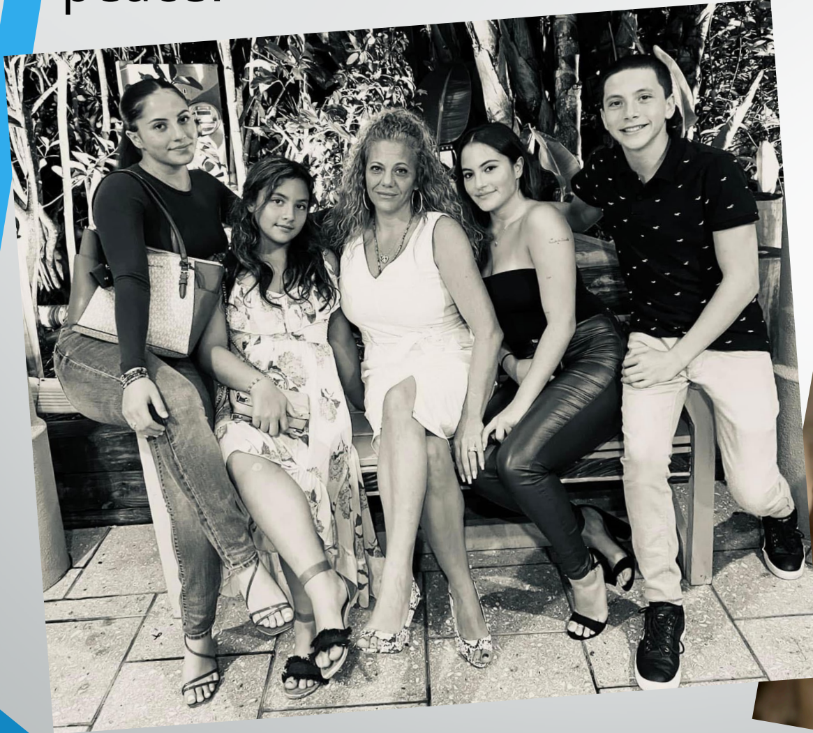
Spending time with my children

What are some things that you do to find joy and peace?